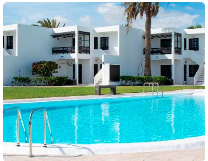
Carco de Palo

chalfontholidays.co.uk Contact the team: 01753 740176